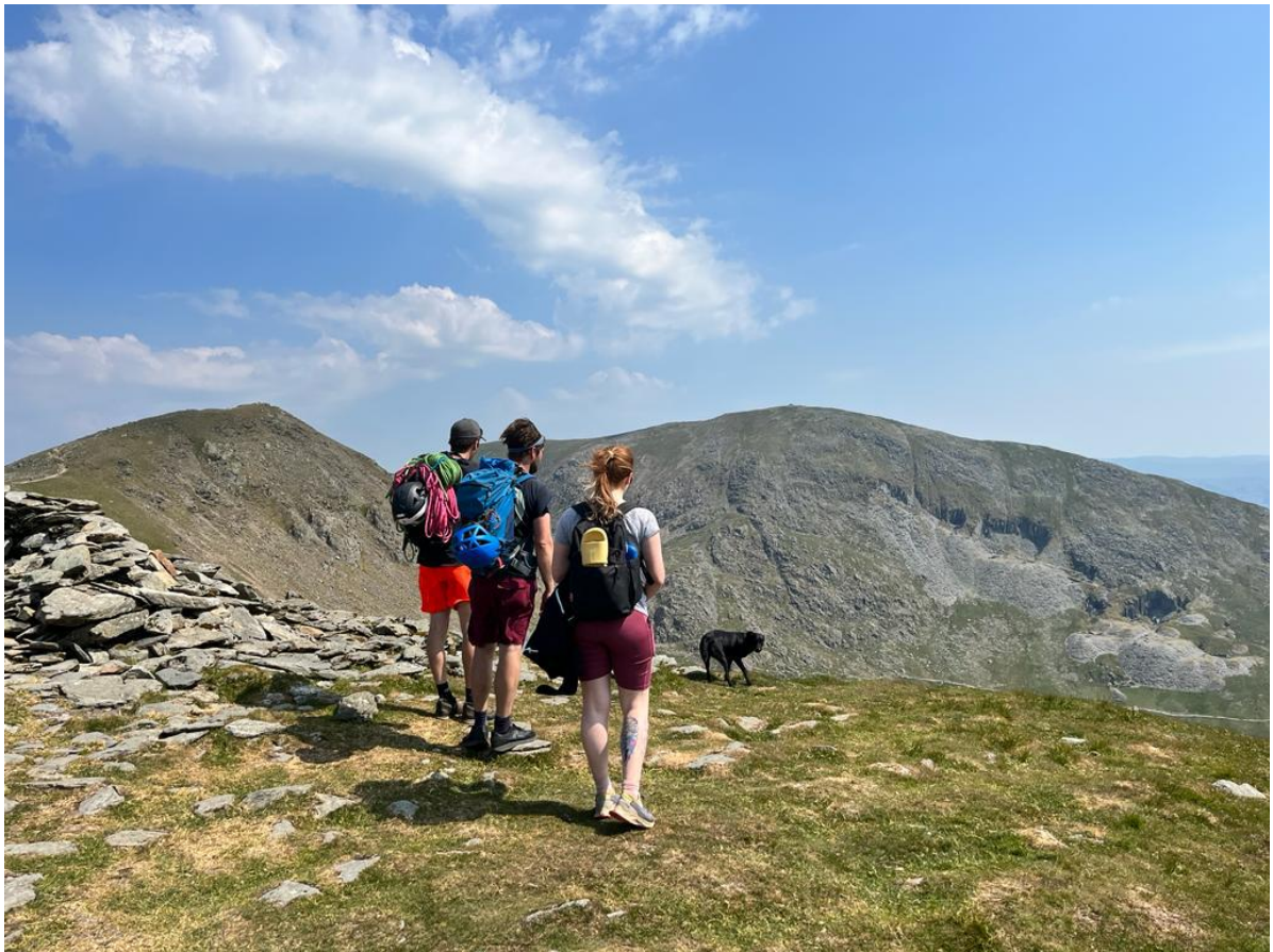
Fabulous Lake District weather!